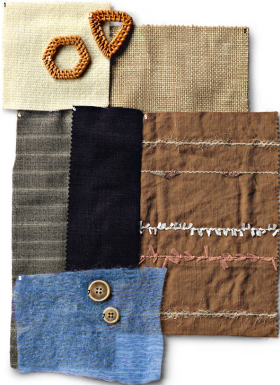
1. Tessitura Attilio Imperiali - 2. Sandra b - 3. Botto Giuseppe - 4. Lanificio T. G. di Fabio 5. Federico Aspesi - 6. Bernasconibiseta - 7. Gruppo Uniesse