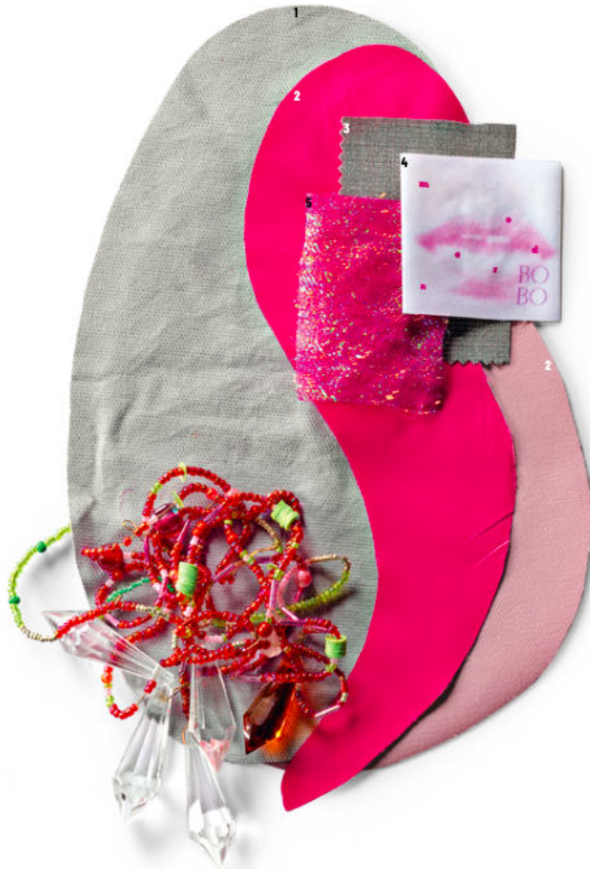
1. Tessuti Pordenone / Olimpias - 2. Tessitura Attilio Imperiali - 3. Botto Giuseppe - 4. Varcotex - 5. Bernasconibiseta