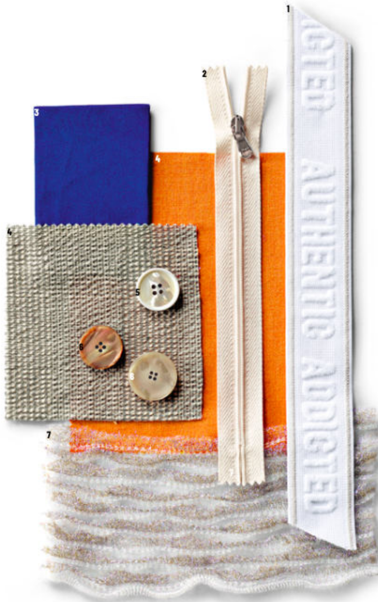
1. Varcotex - 2. Lanfranchi - 3. Tintunita - 4. Botto Giuseppe 5. Gruppo Uniesse - 6. Sandra b - 7. Lanificio dell'Olivo