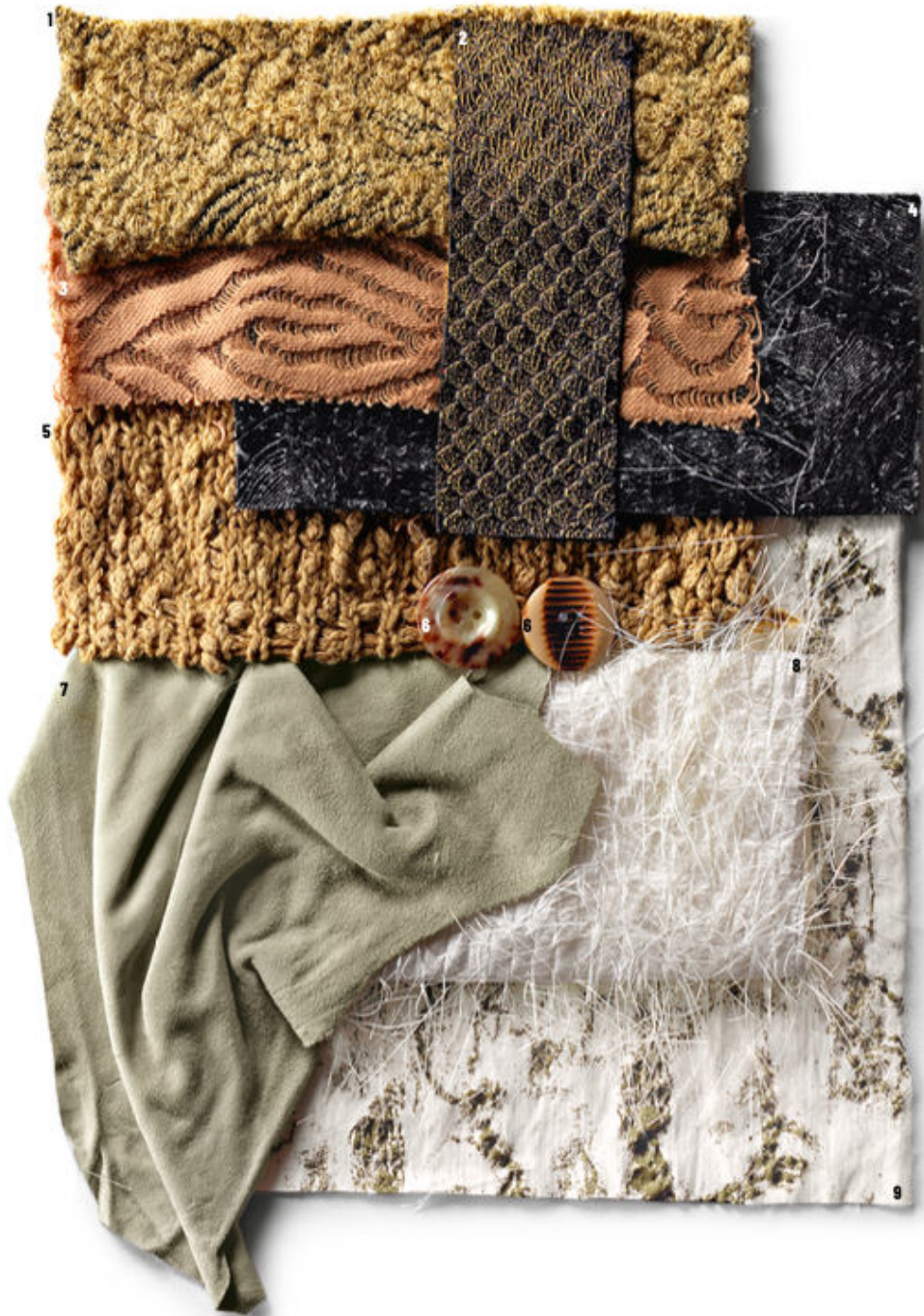
1. Lanificio dell'Olivo - 2. Benericetti - 3. Jackytex - 4. Forza Giovane Art - 5. Igea 6. Gruppo Uniesse - 7. Luxury & Leather - 8. Bernasconibiseta - 9. Inseta