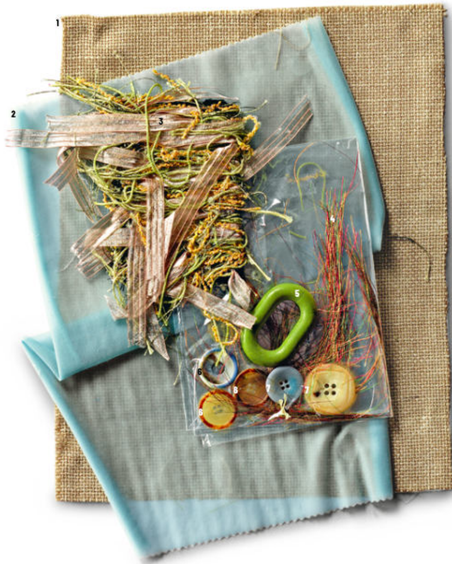
1. Botto Giuseppe - 2. Jackytex - 3. Bernasconibiseta - 4. Gunold - 5. Lartigianabottoni - 6. Sandra b - 7. Gruppo Uniesse