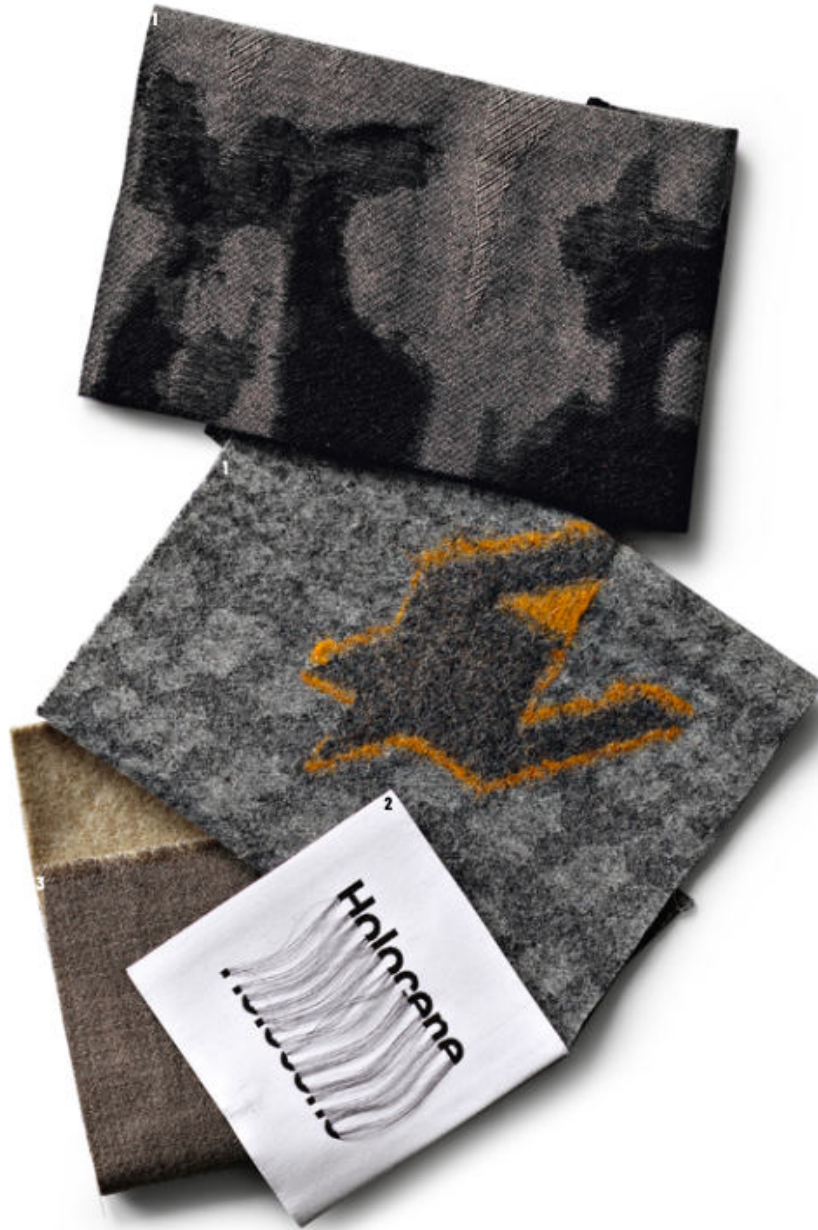
1. Inseta - 2. Reca Mainetti - 3. Botto Giuseppe