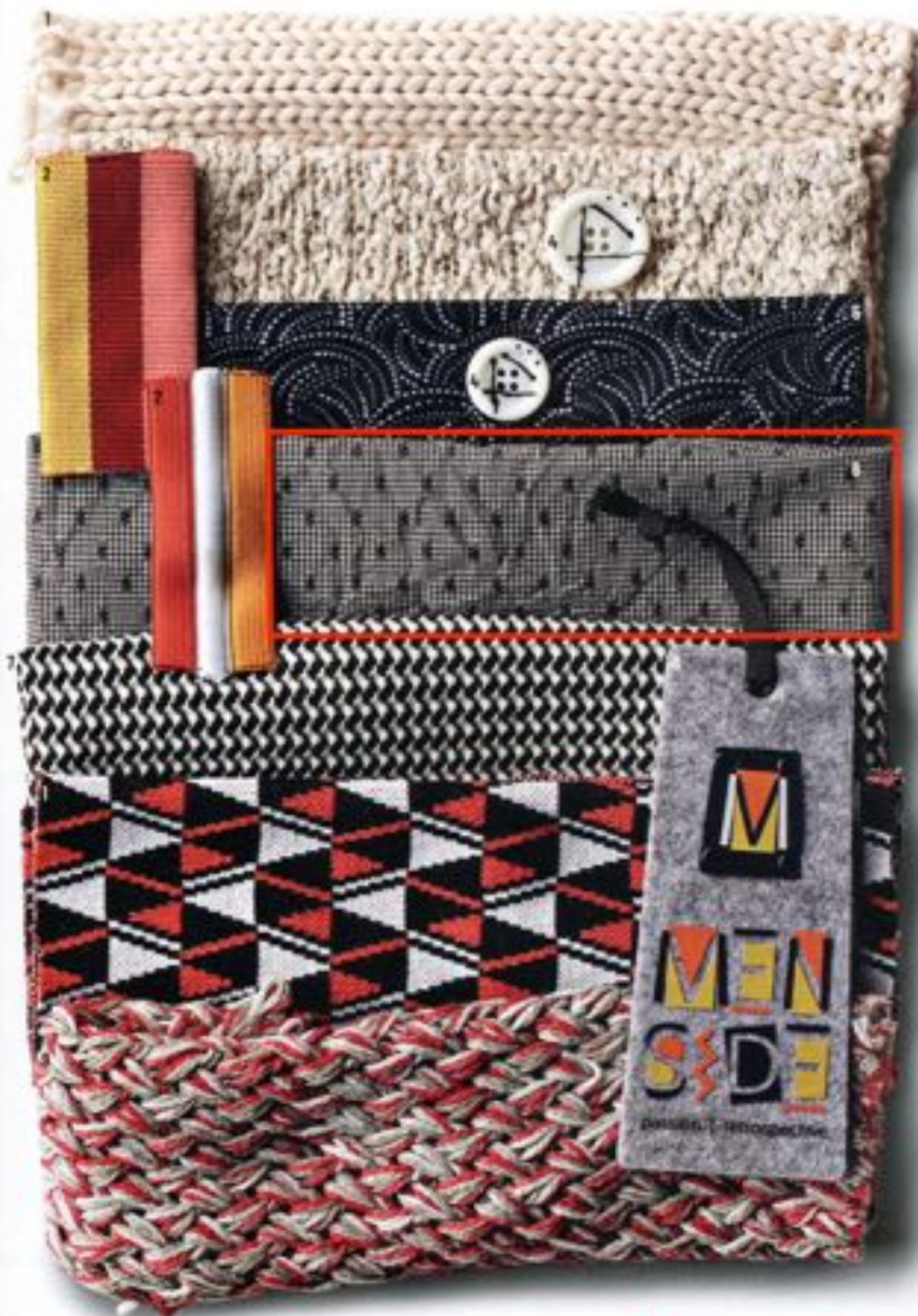
1. Milefilà - 2. Aeffe - 3. Lineapiù - 4. Corra & Frabus - 5. Piove Maitex - 6. Botto Giuseppe 7. Lanificio Moessmer - 8. Emmetex - 9. Lanificio dell'Orto