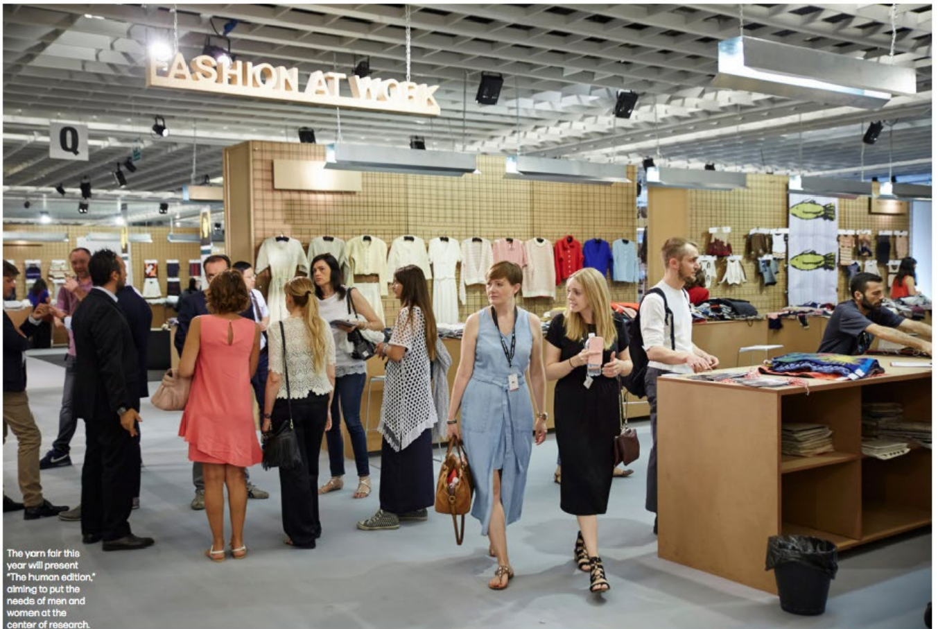
The yarn fair this year will present "The human edition," aiming to put the needs of men and women at the center of research.